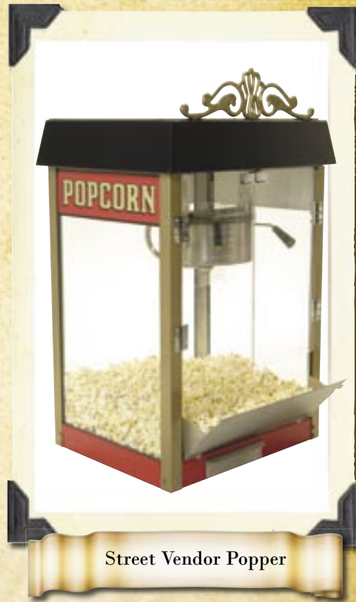
Street Vendor Popper