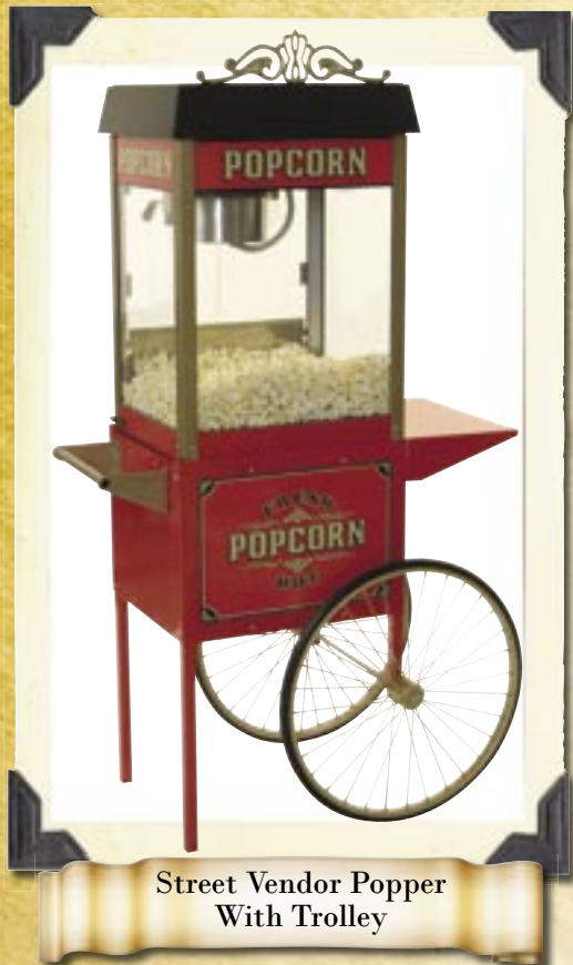
Street Vendor Popper With Trolley

From the boardwalks of Coney Island and Palisades Park these antique styled popcorn machines will remind you of an era when vendors sold popcorn on street corners all across America. Sure to create a fun and friendly atmosphere in any location, these commercial quality machines are available as a counter-top model or with the matching trolley. All of the Street Vendor poppers feature stainless steel food-zones, 20 mil anodized kettles (for easy cleaning), heated warming decks, old-maid drawers (for un-popped kernels), tempered glass panels and an industry longest three year parts warranty.