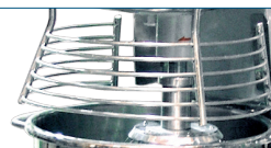
► Safety Guard

This mixer has 3 speeds. It comes complete with 3 attachments, a stainless steel bowl, and a safety guard