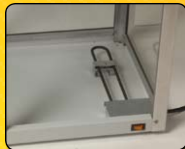
50 watt heating element