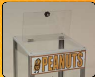
Top-loading for convenience