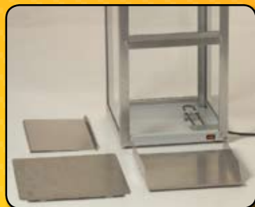
Easy to clean