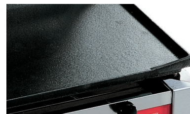
Flat cooking surfaces

M version: grooved top and half flat half grooved bottom