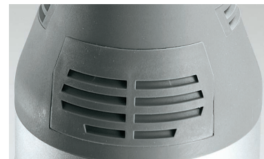
Exclusive ventilation system. Machine works longer!