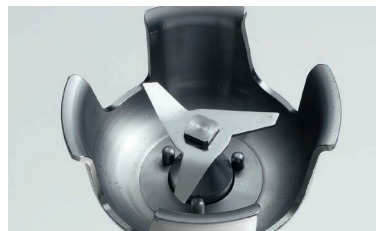
Stainless steel bell. Longer life!