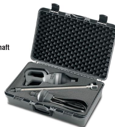
Carrying case option