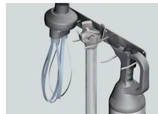
Wall support option