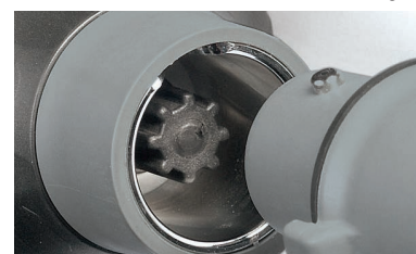
Feed tube "bayonet" slot. Changing shaft is quick & easy.