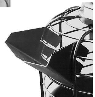
Hobart Ingredient Chute

Listed by Underwriters Laboratories Inc. and certified by NSF International.