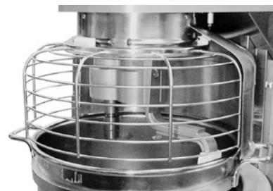
Hobart Bowl Scraper