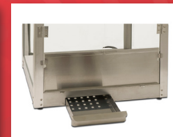
Old Maid Drawer