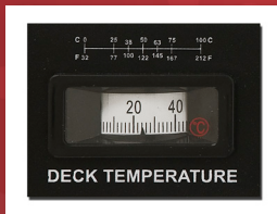
Cabinet Temp Indicator