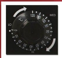
Thermostatically Controlled Serving Temp