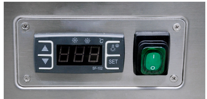
Digital temperature controller & display