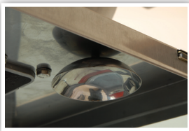
Convenient Snow Cone Shaper