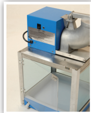
Polycarbonate Service Door