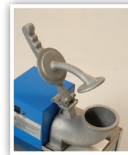
Cast Aluminum Assembly