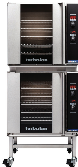
Model E32D5/2C shown