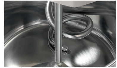
Heavy-duty stainless steel spiral dough hook and kneading bar