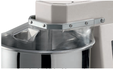
Interlocked lid with opening to add ingredients during operation

Certified to UL 763 and NSF 08 Certified to CSA Standard C22.2