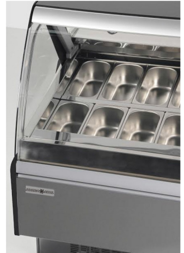
STAINLESS STEEL PANS