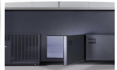
REFRIGERATED REAR STORAGE