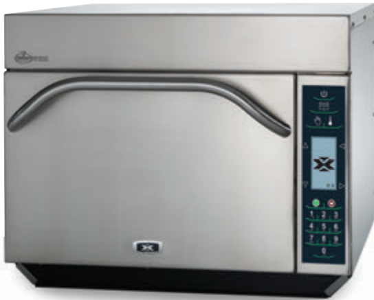
Model MXP22 shown