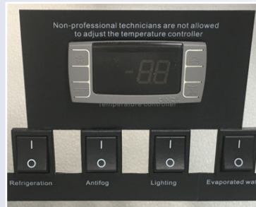
Digital controller: Temperature/ Refrigeration/ Anti-fog/ Lighting/ Evaporated water