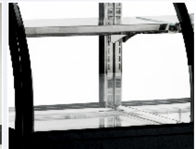
Elegant glass shelving