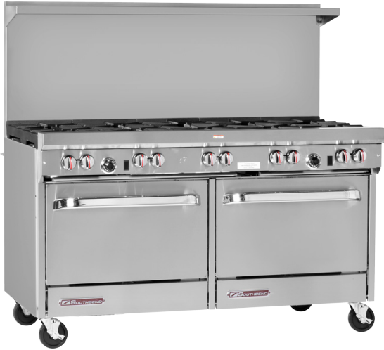
S60DD (shown with optional casters)