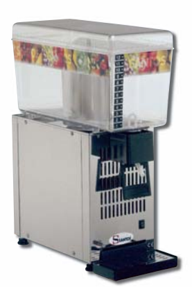
34 - I (single bowl) 12 liter capacity