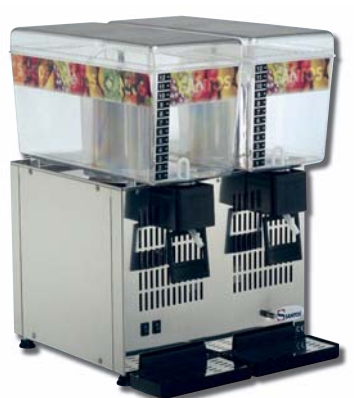
34 - 2 (twin bowl) 2 x 12 liter capacity