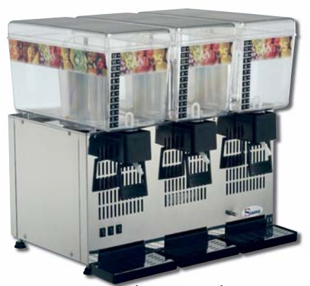
34 - 3 (triple bowl) 3 x 12 liter capacity