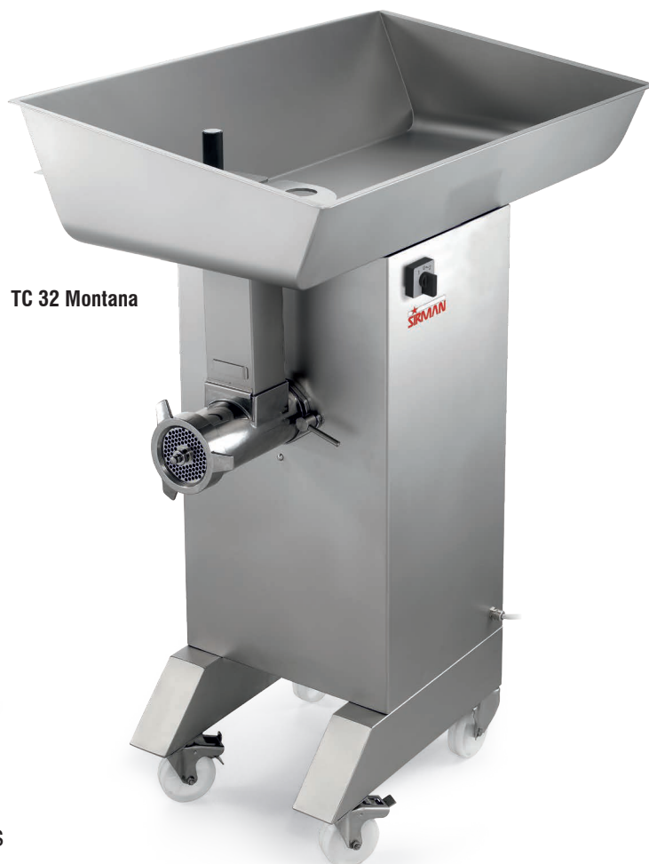
TC 32 Montana