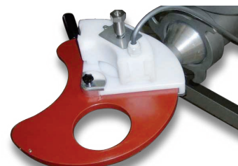
FORMAT S Semi-Automatic Hamburger Patty Maker, for TOP version only