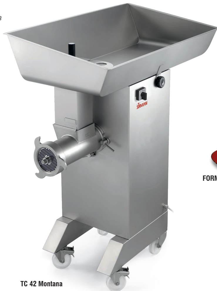
TC 42 Montana

Certified to UL Standard 763 and NSF Standard 08 Certified to CSA Standard C22.2