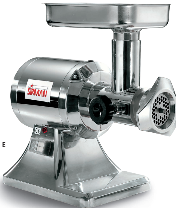
TC 12-22 E