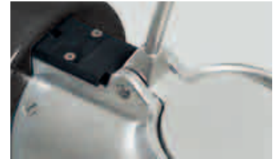
Microswitch on the lever