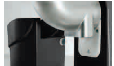
Collecting tray with microswitch