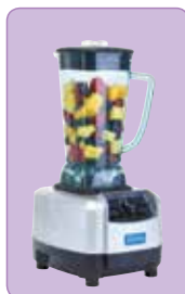
Blend fruits, ice and a variety of other ingredients