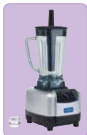
Shown with cap removed & stirring tamper inserted