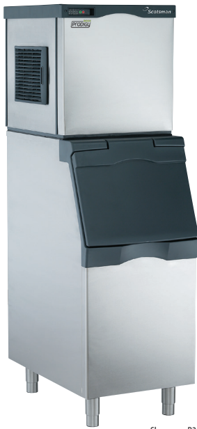
Shown on B3225 bin.